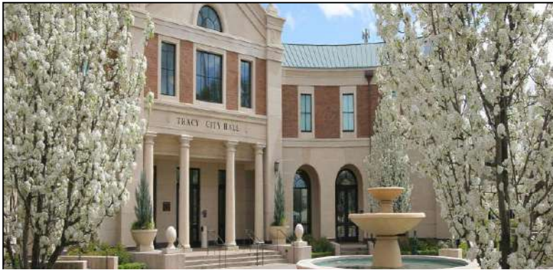
Tracy CA City Hall

A complaint was presented to the San Joaquin County Civil Grand Jury claiming a member of the