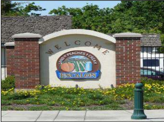
Escalon CA Welcome Sign

Several elected and appointed officials were interviewed for the city of Escalon concerning a written ethics policy. All are aware that the city has a written ethics policy focused on staff, not on elected or appointed officials. A majority believe there should be one. Overall there is a measure of trust and respect between members of the city council who in turn have trust and respect for city boards and commissions.