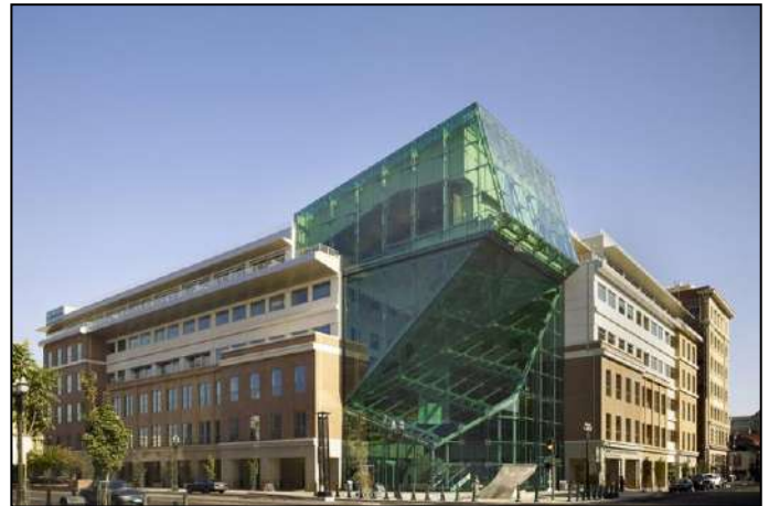
San Joaquin County Administrative Building

The county has a written ethics policy from 2015. The Grand Jury interviewed members of the Board of Supervisors (BOS). Most are aware of the policy.