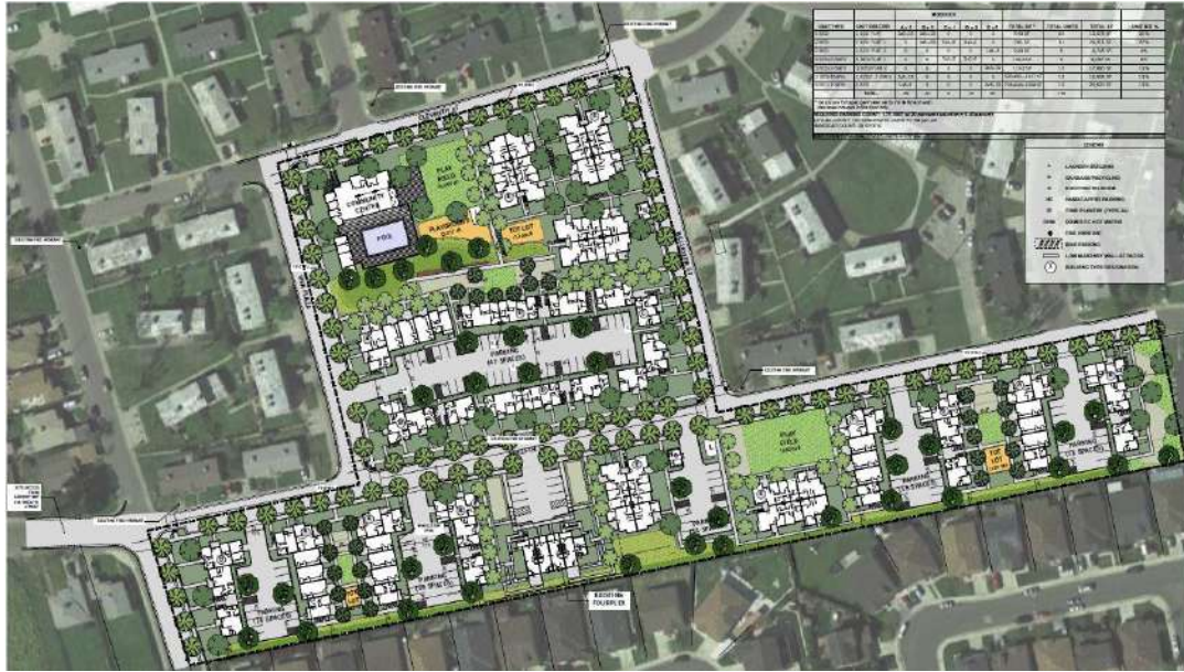
Phase One, Sierra Vista Homes

In addition to the 115 units at Sierra Vista currently under construction, HACSJ is also undertaking the following initiatives: