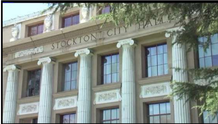
Stockton CA City Hall

The City of Stockton has an extensive and comprehensive ethics policy. Stockton's code of ethics for employees and city officials was last updated November 2, 2017. The policy is written to include elected officials, appointed staff, appointed board and commission members, and employees.