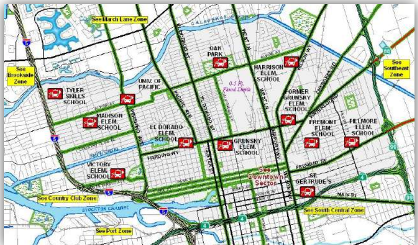
Central Stockton Evacuation map