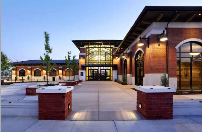
Manteca CA Transit Center

Several elected and appointed officials of the city of Manteca were interviewed concerning any existing ethics policy. Not all are aware that the city does not have a written ethics policy for elected and appointed officials. Manteca does have a conflict of interest policy. Most are amenable to considering the adoption of a written ethics policy. City officials believe that if an ethics policy were developed, it should cover all employees as well as elected and appointed officials.