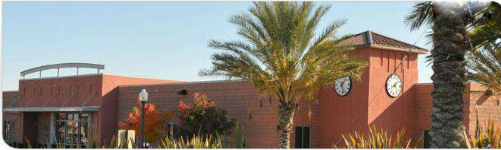
Lathrop CA City Hall

The Grand Jury interviewed several elected officials of the City of Lathrop to determine if the city had a written ethics policy and whom it governed.