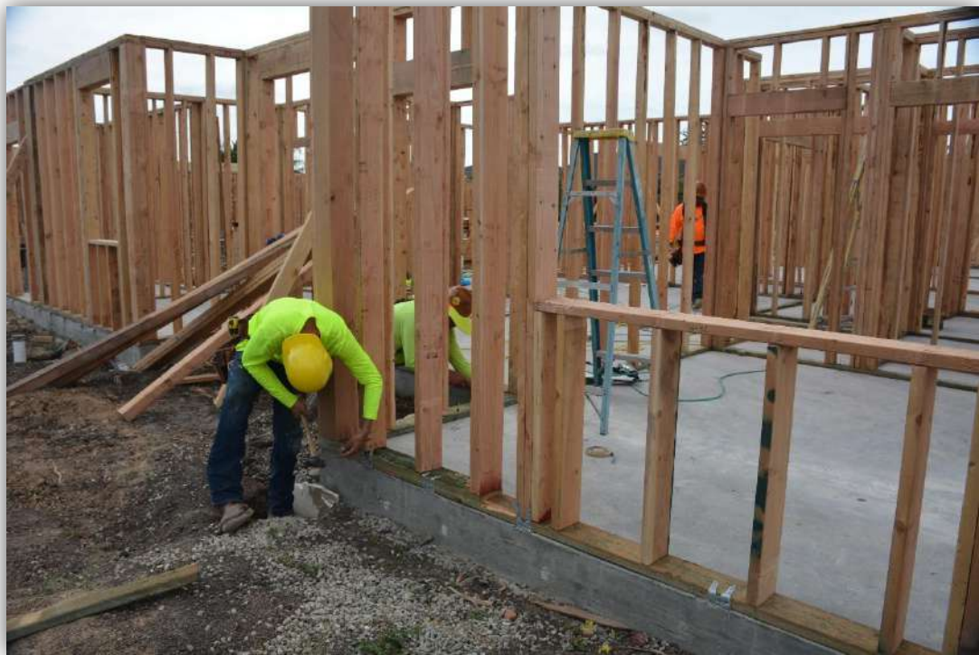
Framing Sierra Vista Housing

The Housing Authority has received an award of an additional 25 U.S. Department of Housing and Urban Development-VA Supportive Housing (HUD-VASH) Program vouchers for veterans. In partnership with the Veterans Administration, rental assistance and case management services will be provided for up to 234 homeless and formerly homeless veterans in San Joaquin County. To ensure that the most vulnerable in the veterans’ community receive the help they need to find quality housing, HACSJ has hired a dedicated caseworker from Sacramento Self-Help Housing.