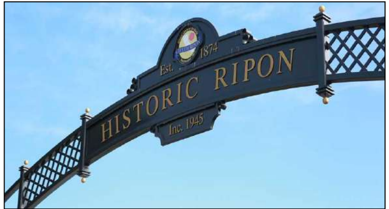
Gateway to Ripon CA Arch

Several elected and appointed officials were interviewed for the City of Ripon concerning a written Ethics Policy. None know if the city has a written ethics policy, but most feel it is a necessary document. Most hold that an ethics policy should include elected officials, appointed commissioners, senior staff, and most other employees. None know if the human resources department has an ethics policy for employees.