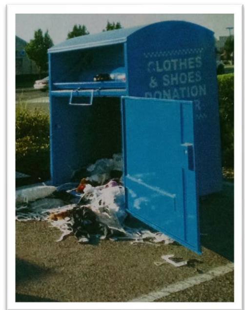
Photo of an unattended donation bin in San Joaquin County.

In recent years, unattended donation bins placed by for-profit companies have been appearing in cities and unincorporated areas of San Joaquin County. These unattended donation bins are having a significant negative impact on donations to non-profit charities. There are no ordinances in San Joaquin County and its cities to enable authorities to regulate these for-profit unattended donation bins that are often simply dropped on private property without the owner's consent. In addition, there are safety