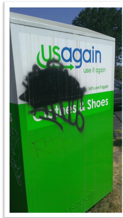
Unattended bin, Country Club Boulevard, Stockton

Despite the proliferation of the for-profit unattended collection bins, the Grand Jury found no uniform city or county ordinances to regulate the placement and maintenance of for-profit bins.